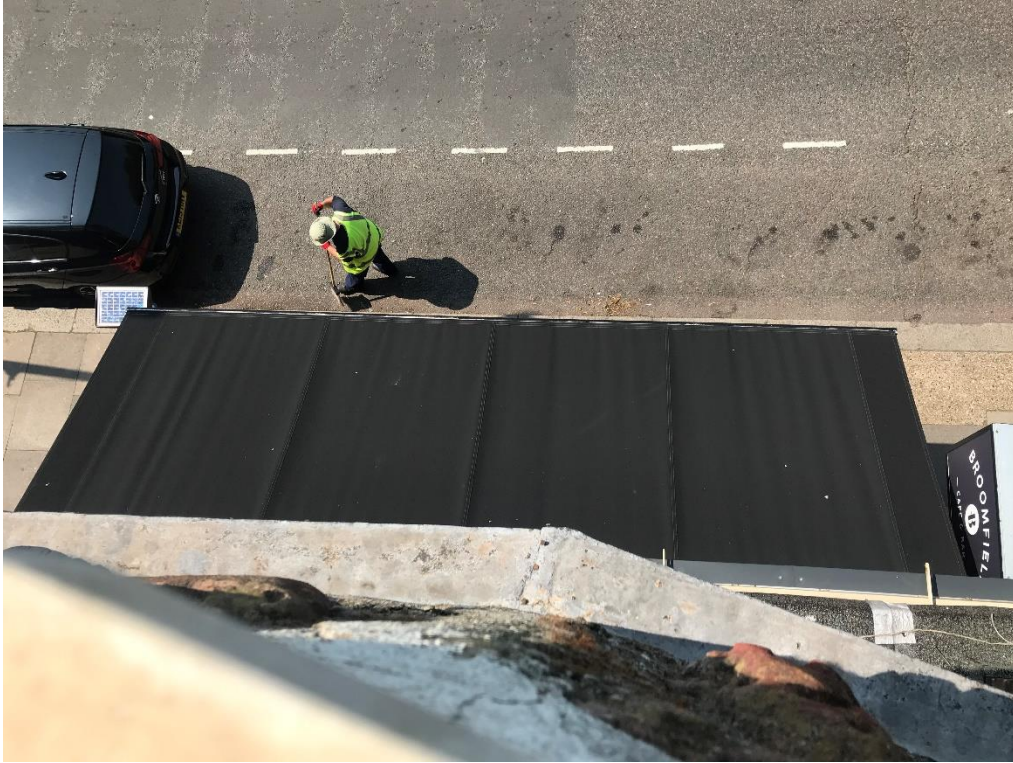
JE Image from Room 4 24 th June Image 9