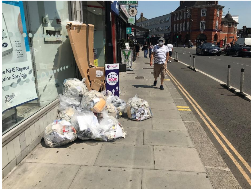
JE Image 24 th June Boot Pharmacy Image 15