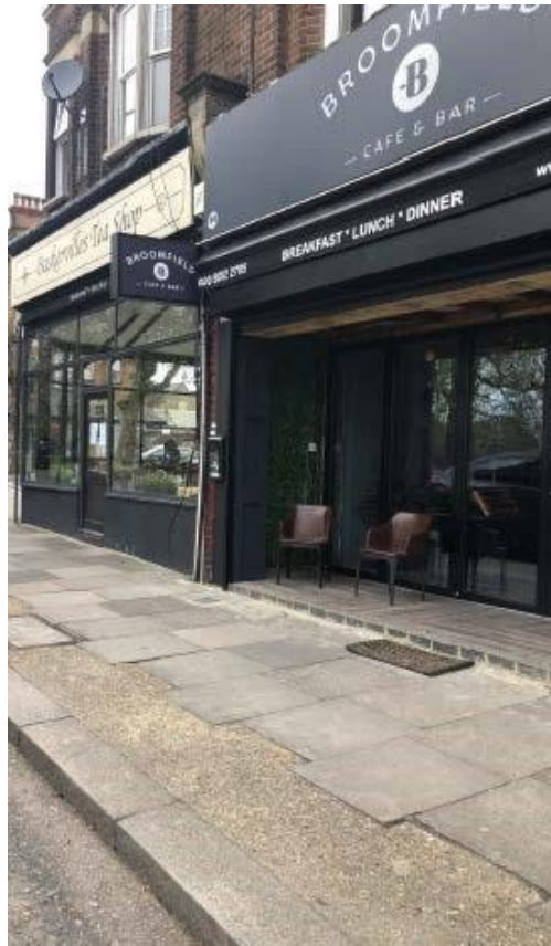
New Shop Front Image 18