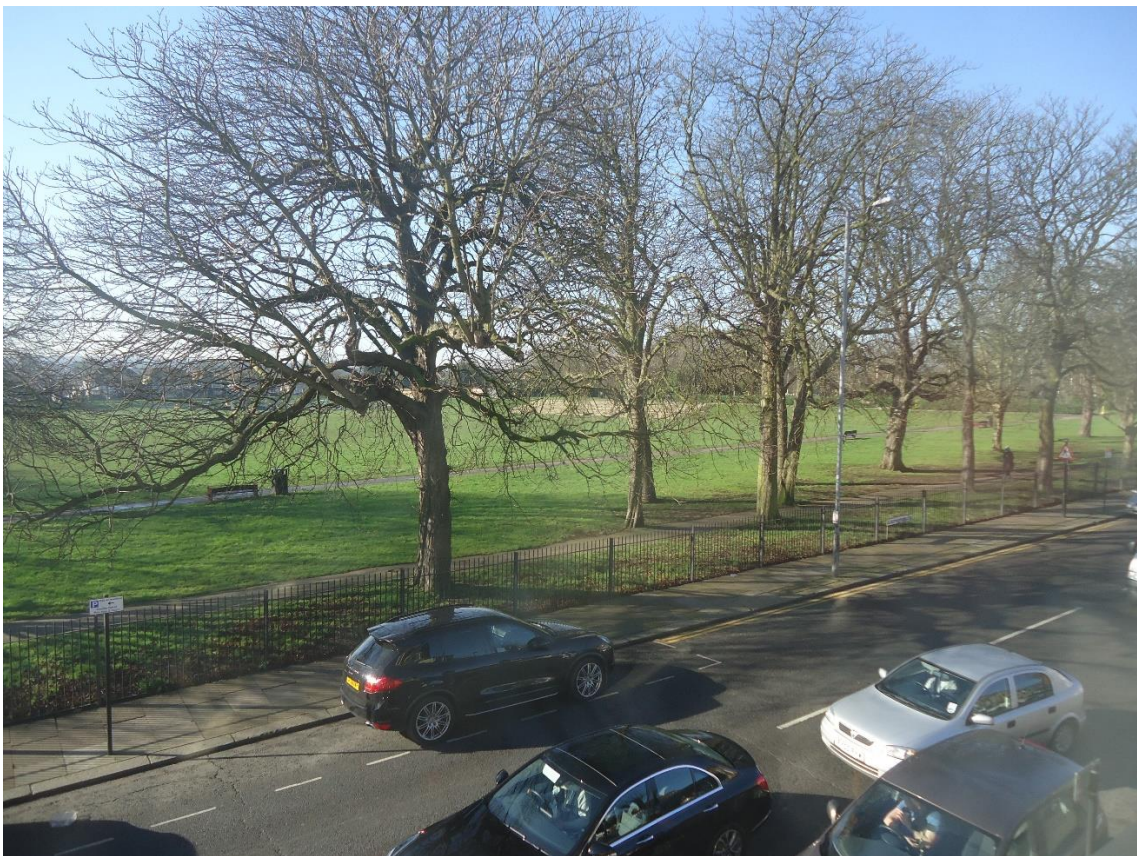
JE Image from Room 1 Winter 2019 Image 8