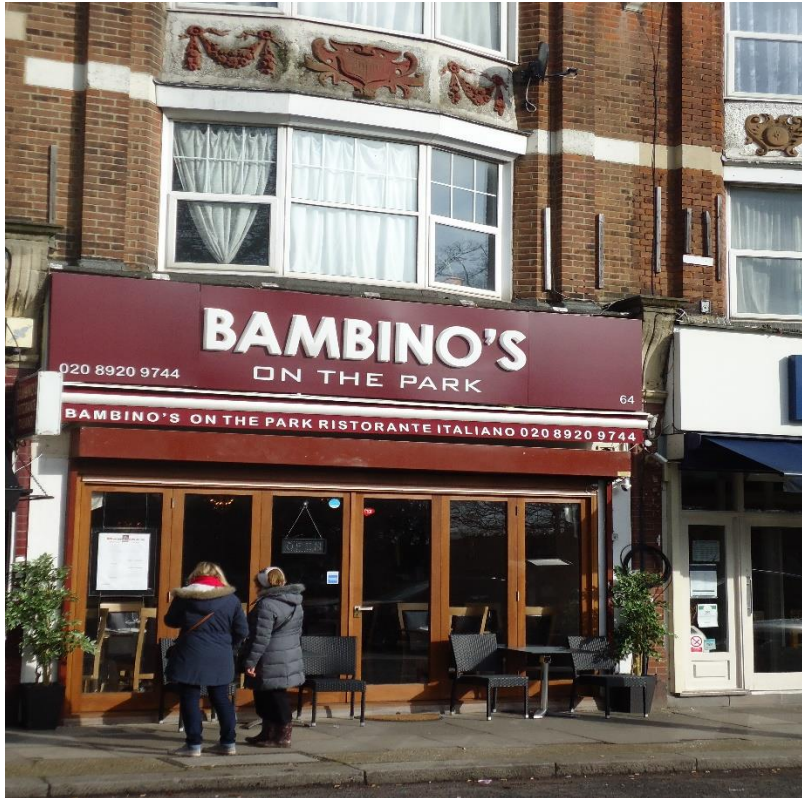
JE Image Old Shop Front Image 16