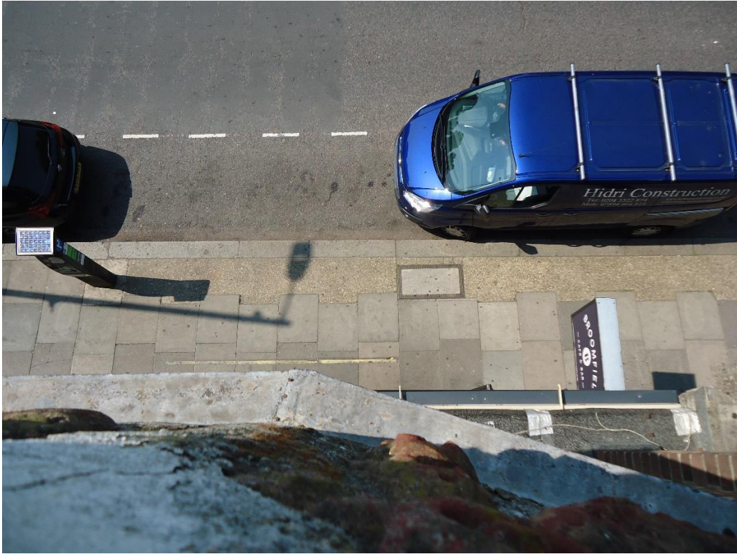
JE Image from Room 1 28 th June Image 6