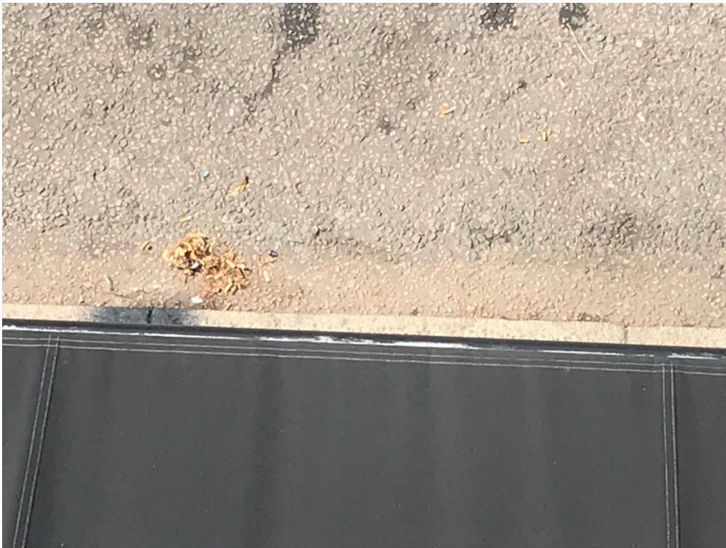
JE Image from Room 4 24 th June Image 10