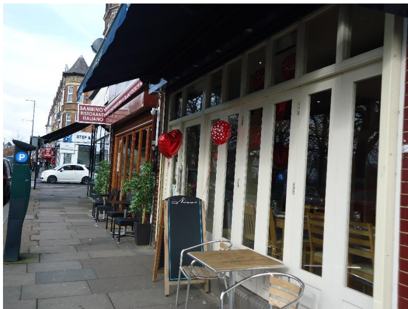
JE Image Old Shop Front Image 17