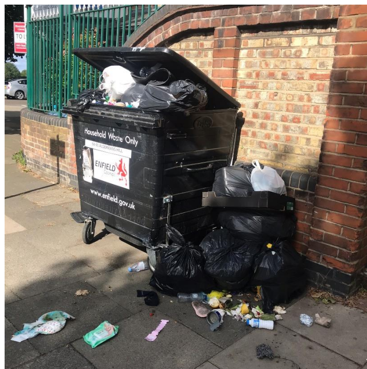
JE Image 28 th June Grovelands Road Image 12 Steff and Phillips