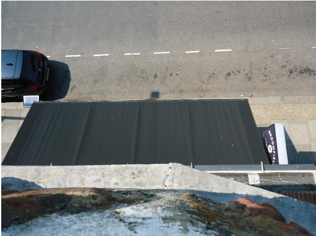
JE Image from Room 1 28 th June Image 7