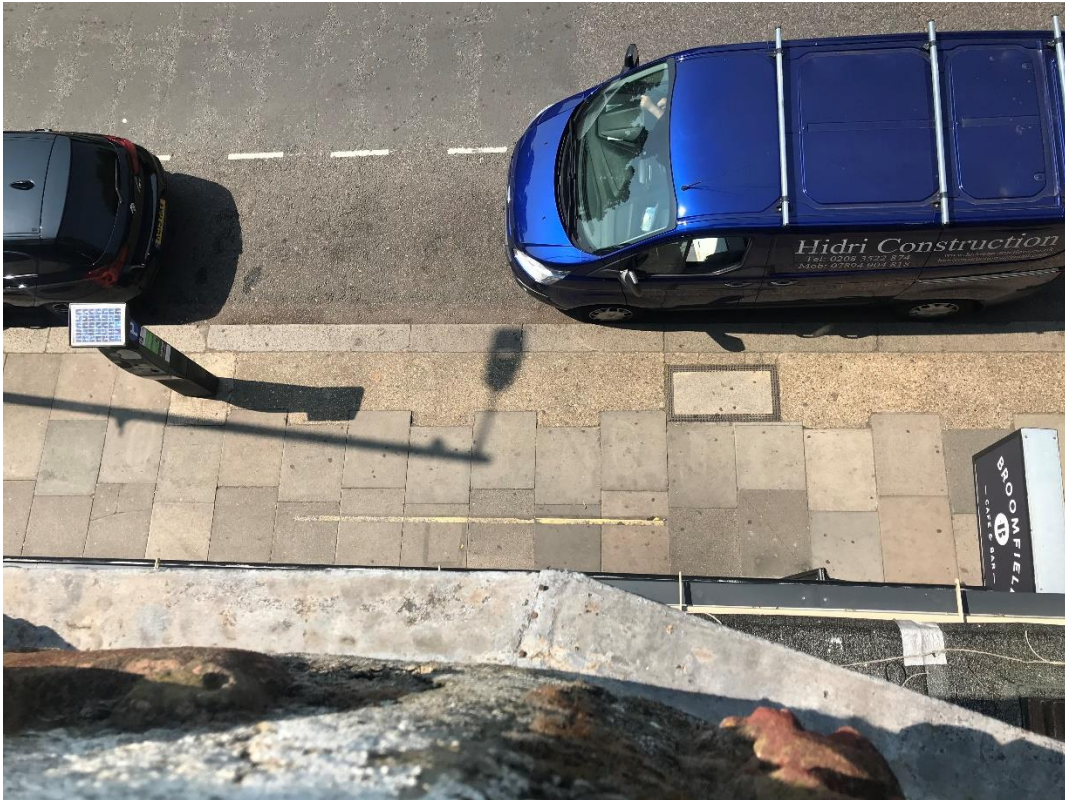
JE Image 2 Sunday 28 th June