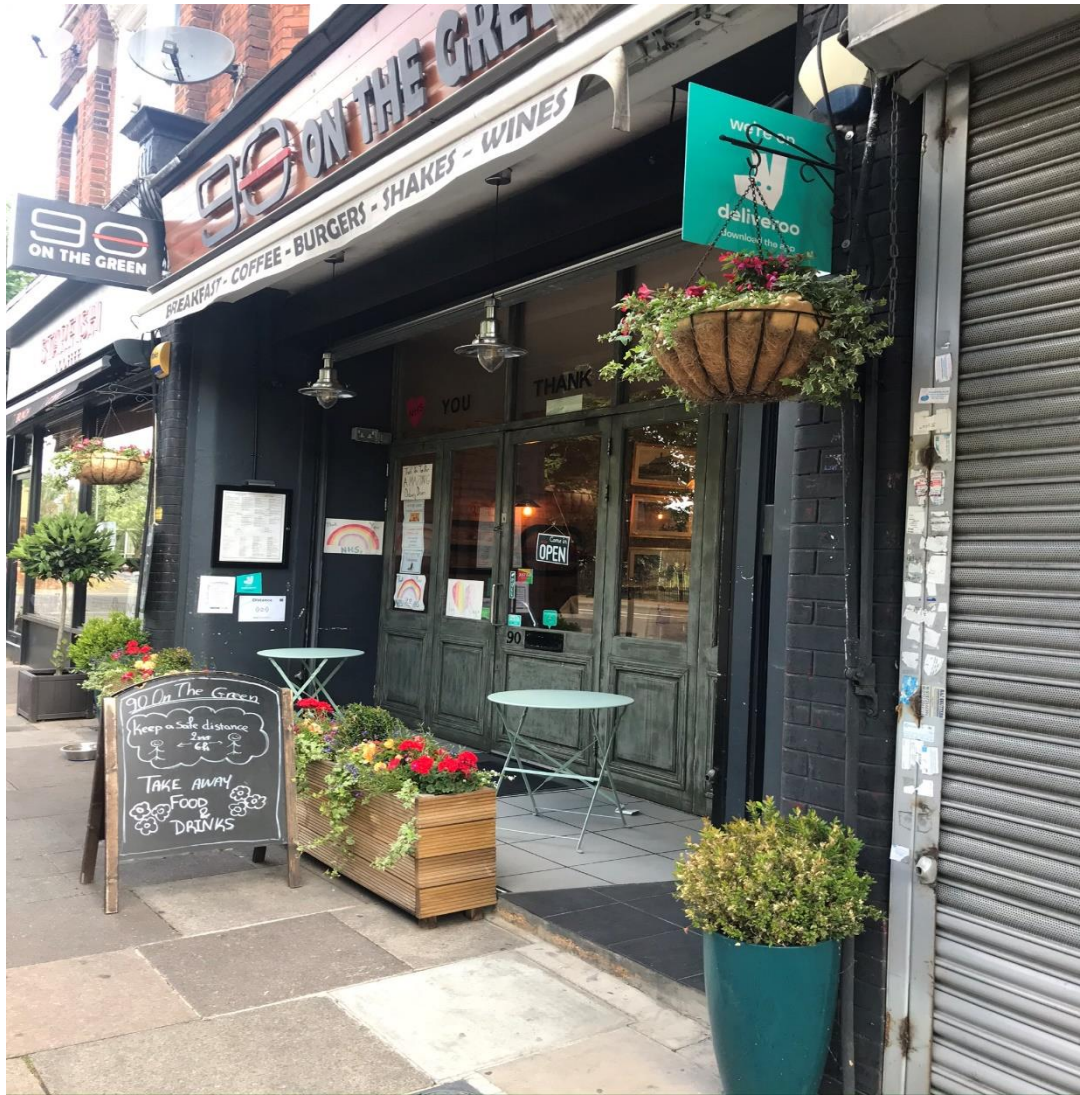
JE Image 90 Aldermans Hill Image 19