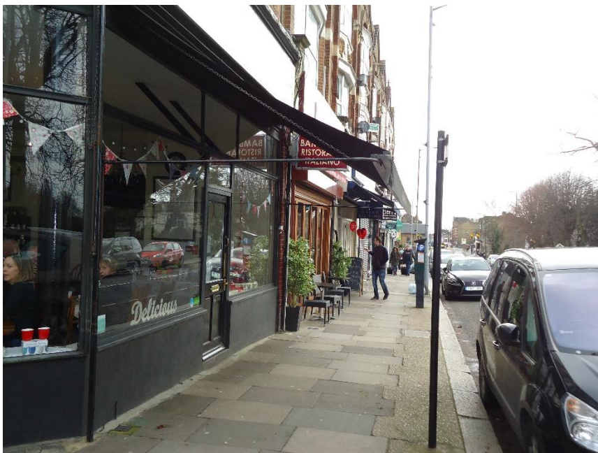
JE Image 1