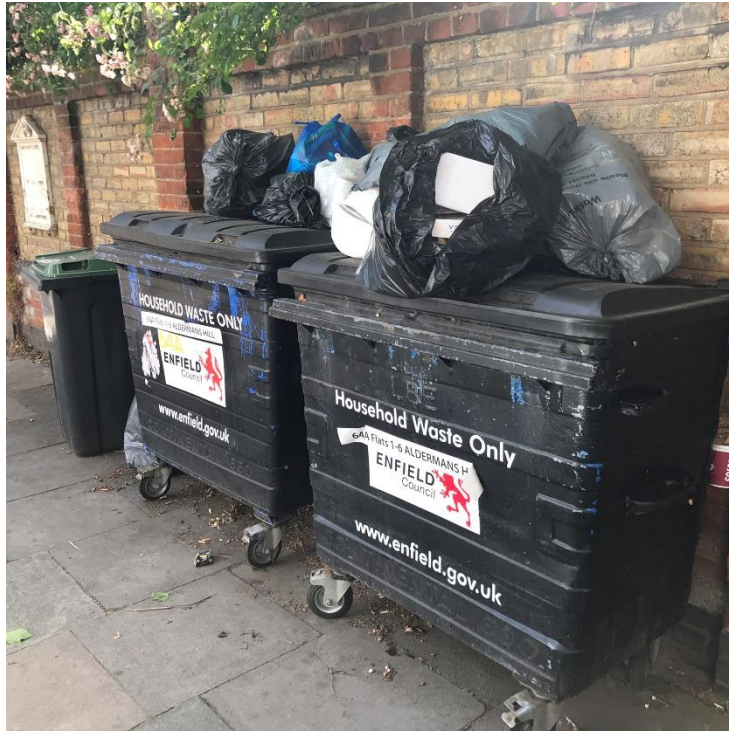
JE Image Sunday 28 th June Image 11 Resident 62a and 64a Aldermans Hill